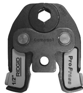
Figure 3 – Jaw With ID Clip – No Action Needed