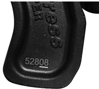
Figure 2 – Jaw Date Code "08"